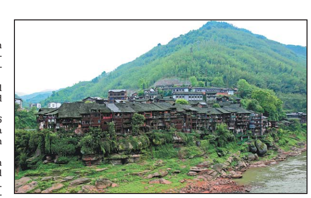
Bing'an, an ancient town, is located on the banks of Chishui River in Southwest China's Guizhou province.

Many sports events have been staged in the area since the road's inauguration.