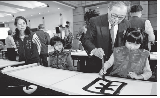
The character "kun", meaning trapped, is voted word of 2019 XINHUA across Taiwan Straits.