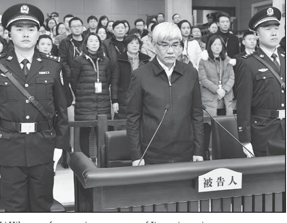
Li Yihuang, former vice-governor of Jiangxi province, was sentenced to 18 years in prison on Tuesday for taking bribes.

In 2008, when Jiangxi Copper purchased the prospecting rights of a local silver mine, Li violated the regulation to purchase it at a