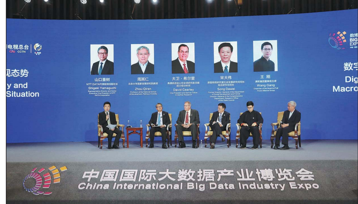
Experts from China and overseas talk about the role of big data in economic development during a high-level dialogue at the expo.