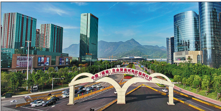
The China (Fujian) Pilot Free Trade Zone serves a platform to promote economic cooperation between Fujian and the countries and regions involved in the Belt and Road Initiative.

It is home to 3,891 overseas enterprises including Fortune