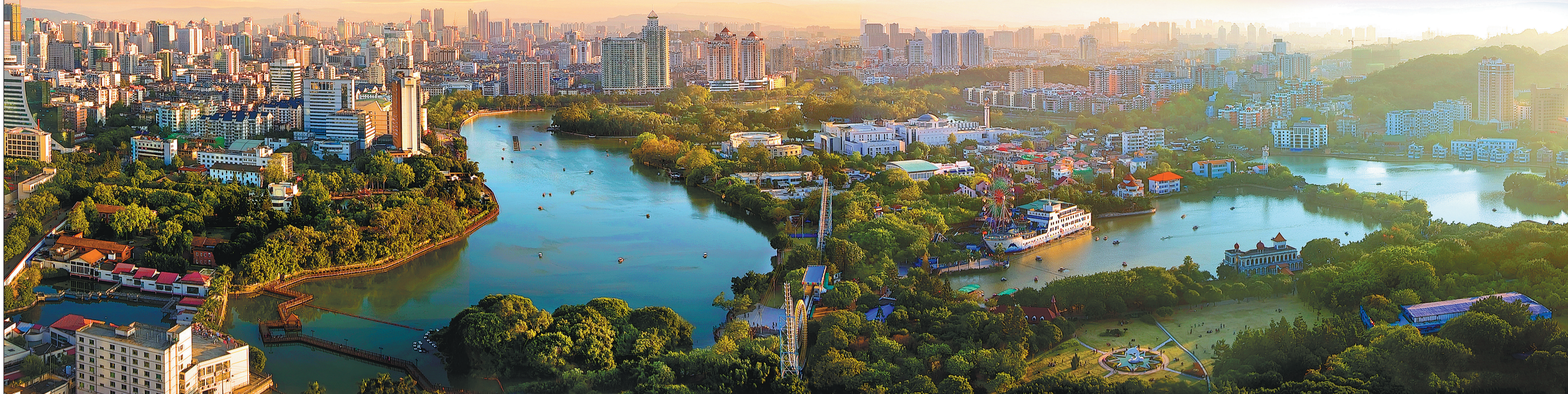
The view of Fuzhou, capital of East China's Fujian province, which is one of the most livable cities in China with a good natural environment and solid economic foundation.

Province builds infrastructure, helps companies invest abroad and ramps up cultural exchanges, Liang Kaiyan reports.