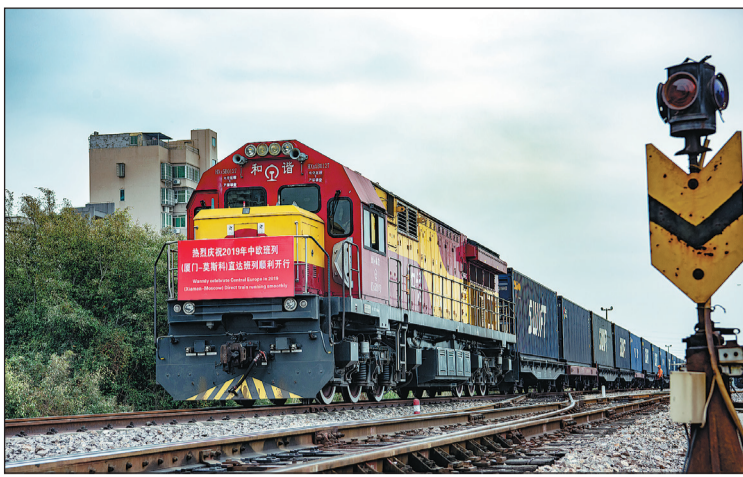
A new freight train service from Xiamen to Moscow is a key part of the China-Europe freight train route.