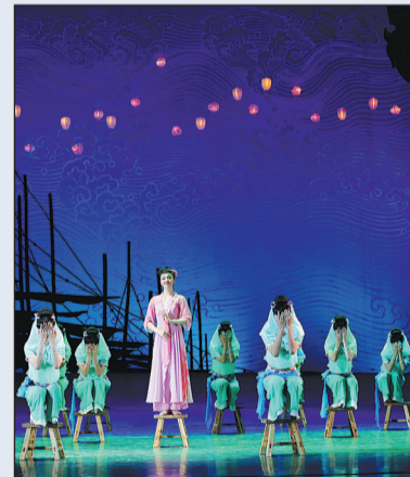
The Dream of Maritime Silk Road reproduces the bustling and thriving sights of the Quanzhou port 800 years ago.

Production of the film aimed to carry out China's strategic concepts regarding the Silk Road Economic Belt and the 21st-Century Maritime Silk Road, develop the province's oceanic culture and better serve and participate in the construction of the Belt and Road Initiative.