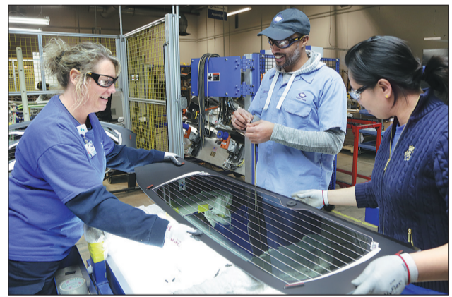
Clockwise from above: The Xiamen Port is expected to handle 20 million containers per year by 2035. Staff members check facilities at the production line of a global company in Fujian. The automatic production line of the lithium-ion battery provider CATL.

The province will expand overseas markets by increasing the export of self-brand products and developing service trade."