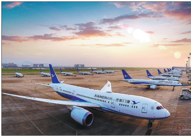
The plane fleet of Xiamen Airlines.

"With the promotion of the BRI, the platform has helped to connect logistics and resources