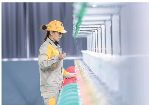
▲ A worker is busy in Hengli (Guiyang) Industrial Park

How big is a manufacturing facility of 227 hectares? Roughly the size of 317 standard football pitches. It can produce 500,000 meters of high-end fabric per day, about 1,250 times the perimeter of a standard track and field arena. A water jet loom used here can produce 300 meters of cloth per day, which is enough to make 200 pieces of clothing.