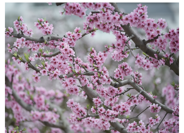
▲ Peach blossoms in Yongle Peach Orchard

"The peach tree is young and elegant; Brilliant are its flowers!" The famous verse in the Book of Songs celebrates the beauty of spring. If you want to view peach blossoms in Guiyang, the Yongle Peach Orchard, which covers a land area of about 667 hectares, is an unmissable place.