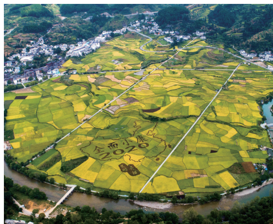
▲ Kaiyang Scenic Corridor

Guiyang's Kaiyang County is famous for its rapeseed oil. When the rapeseed plant is in full bloom, visitors will feast their eyes on a dazzling sea of yellow. At Diwoba besides the Qinglong River at Kaiyang Scenic Corridor, there is a flat field formed due to erosion and deposition by the river which surrounds it on three sides, forming a semi-circular big bend with a diameter of more than one kilometer. During the flowering season of rapeseed, the clear river and the flower fields complement each other, hence the name "Emerald Green Water and Golden Basin".