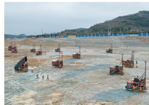
▲ Construction site of the CATL Battery Project

At the end of 2021, the Guizhou-based CATL Renewable Energy Drive System and Battery Manufacturing Center Project was launched in Gui’an New Area, with a total land area of about 96 hectares. According to the plan, the manufacturing center will have an annual output of 60GWh. As the world’s leading renewable energy and tech innovation company, CATL will use in this project the most advanced production lines, which have an automation rate of 95%. At present, the construction is in full swing.