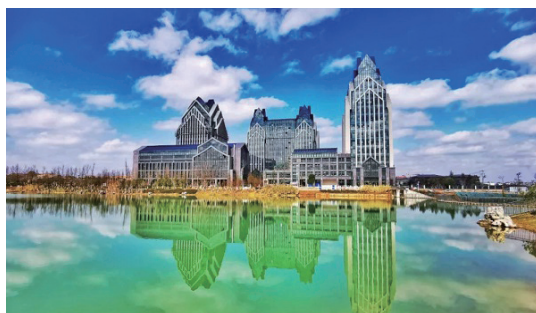
▲ Guiyang Big Data Sci-tech Innovation City

It is stated in the Opinions of the State Council on Supporting Guizhou in Blazing New Trails in the Development of the Western Region in the New Era that it is necessary to promote the construction of the National Big Data Comprehensive Pilot Zone and the Guiyang Big Data Sci-tech Innovation City, and increase the support for artificial intelligence, big data, blockchain, cloud computing and other emerging digital industries.