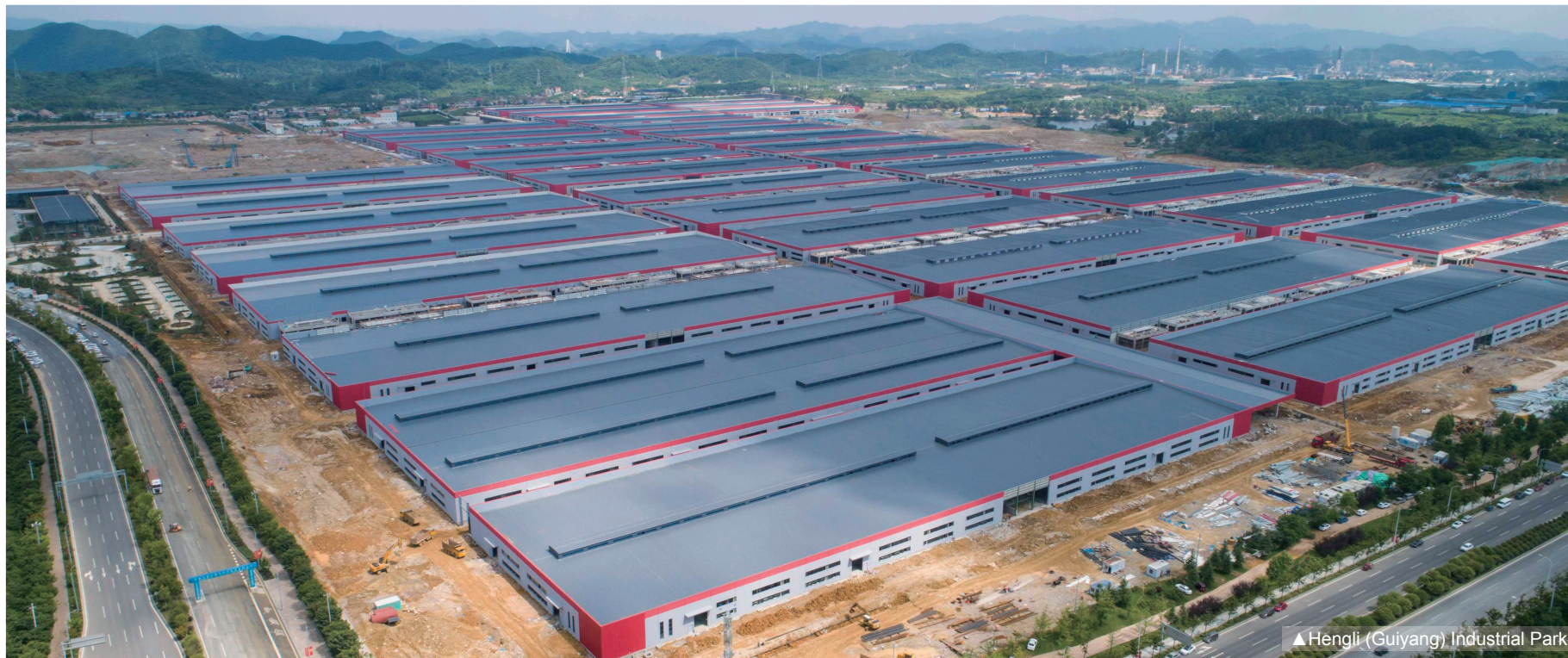
▲ Hengli (Guiyang) Industrial Park

In recent years, Guiyang has received a number of honors and awards in business environment, including an “Exemplary Chinese City in Building World-Class Business Environment”, one of the Top 10 Chinese Cities with Best Business Environment and one of the 100 Best Cities for Ease of Doing Business in the Chinese Mainland. Thanks to the great importance Guiyang and Gui’an have attached to improving the business environment, a large array of flagship industrial projects have been launched, which will effectively bolster high-quality economic development.