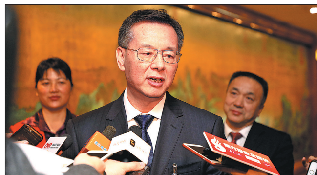
Jiang Jianjun, mayor of Zhanjiang, shares his ideas on economic development at the sidelines of the ongoing 13th National People's Congress in Beijing.

Yang Song, president of GSD Construction based in Shenzhen, Guangdong spent more than 100 million yuan to build 38 new villas for villagers of his hometown in Wuchuan of Zhanjiang, in an effort to improve their living standards. "The entrepreneurs brought back their advanced ideas to their hometown and conveyed modern knowledge and civilization to villagers," said Zhanjiang's Mayor Jiang Jianjun.