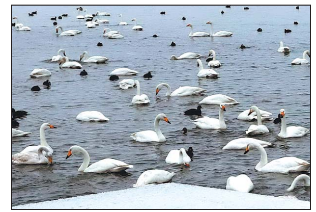
Whooper swans gather in the water at a park in Rongcheng, Shandong province, on Tuesday. From November to April each year, tens of thousands of whooper swans travel thousands of kilometers from Siberia and Mongolia to the coastal city of Rongcheng to spend the winter, presenting their grace and beauty.