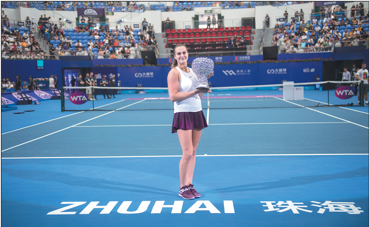
Aryna Sabalenka of Belarus claims victory at the Hengqin Life WTA Elite Trophy Zhuhai on Sunday.