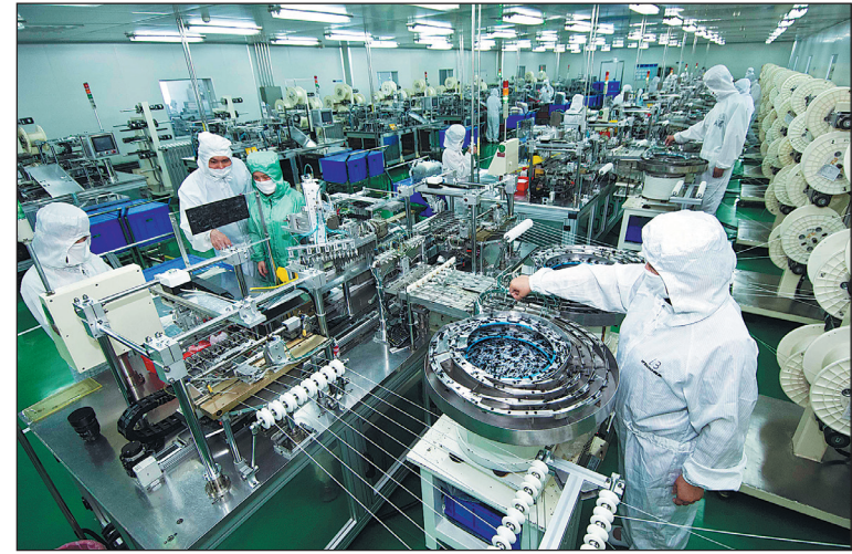
From left: Hewlett Packard employees work on the production line in Weihai. HP decided to manufacture printers in the city last year. Weihai is making a name for its modern and healthy lifestyle. Staff work on the production line of Wego, a medical equipment manufacturer in Weihai.