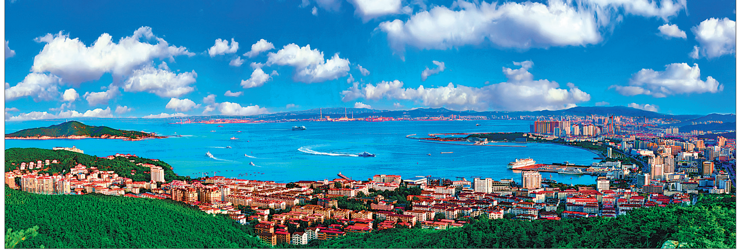
Weihai is promoting its internationalization, economic upgrade, marine economy and rural development to support regional growth. zhu сниххао / ғоя сніха ракц