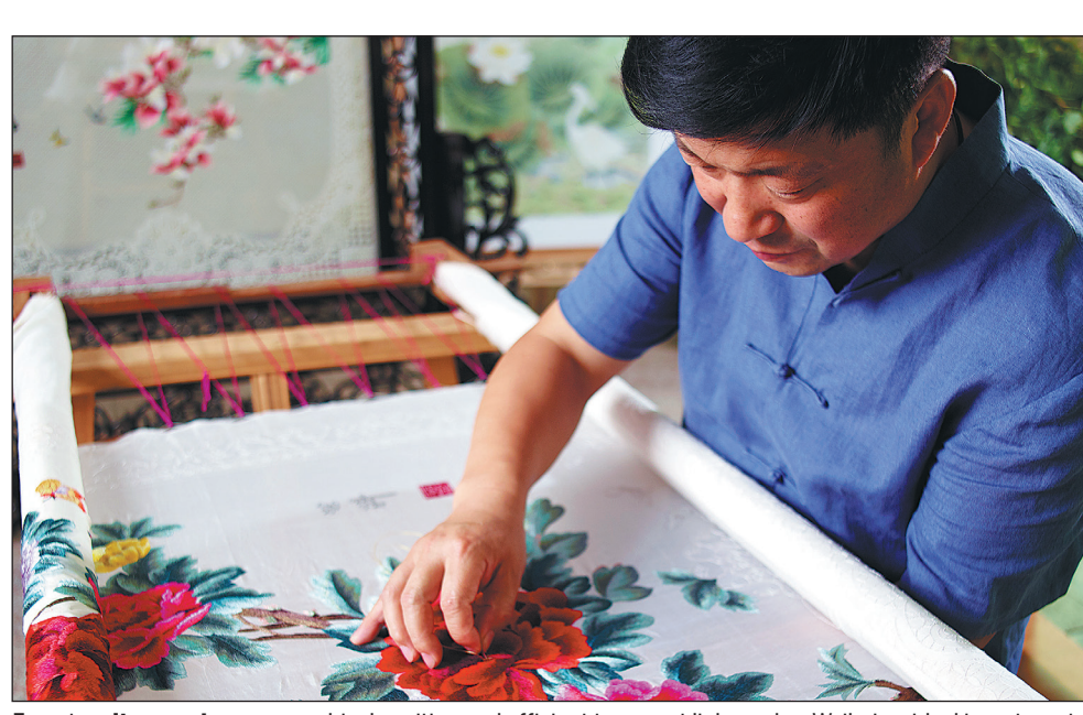
From top: Its premium geographical position and efficient transport links makes Weihai an ideal investment destination for businesses. PROVIDED TO CHINA DAILY Weihai is home to a great number of mountains, bays and wild animals. Wang youmel / For China daily Weihai is home to Luxiu — a local embroidery renowned for its rich and colorful patterns. PROVIDED TO CHINA DAILY

focusing on innovation, smart manufacturing, healthcare and becoming more modern and creative.