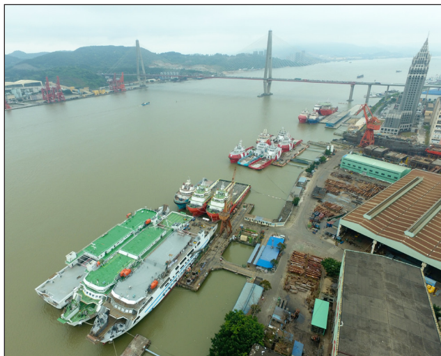
An fleet of fishing boats is docked alongside a seafood exchange the China (Fujian) Pilot Free Trade Zone.

Data from a survey carried out by a third party organization show that 90.8 percent of the local enterprises