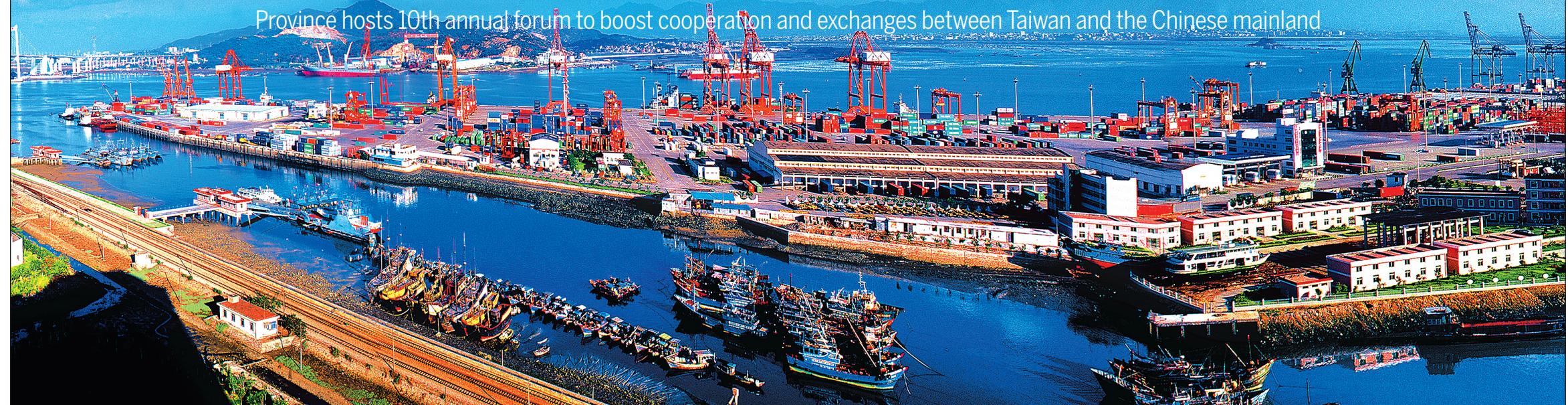
A bird's-eye view of the Dongdu port area in Xiamen, Fujian province.

Province hosts 10th annual forum to boost cooperation and exchanges between Taiwan and the Chinese mainland