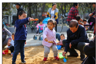
Children play with sand at Min'an Park — a pocket park in Weifang.