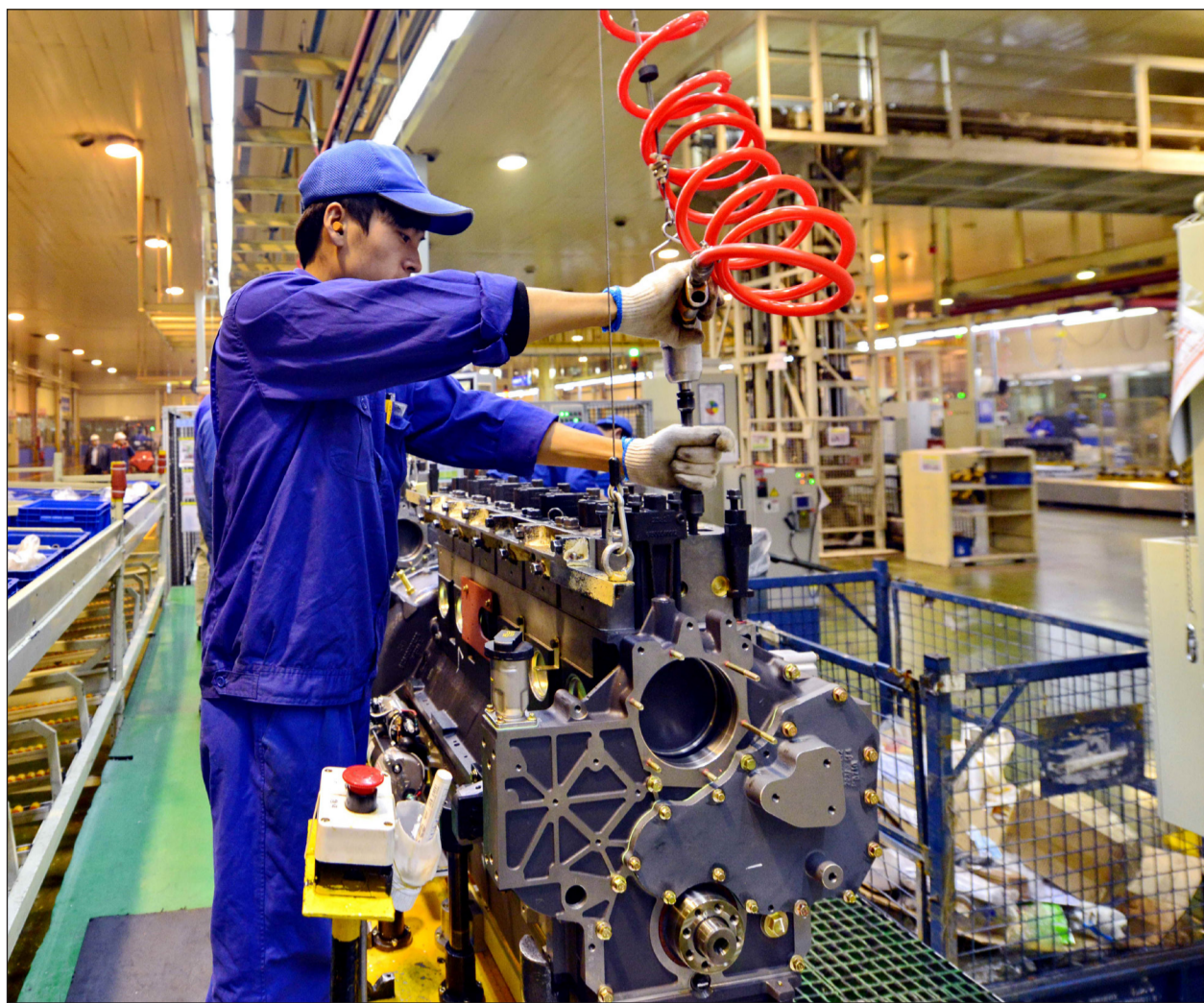
A Weichai worker operates an engine production line.