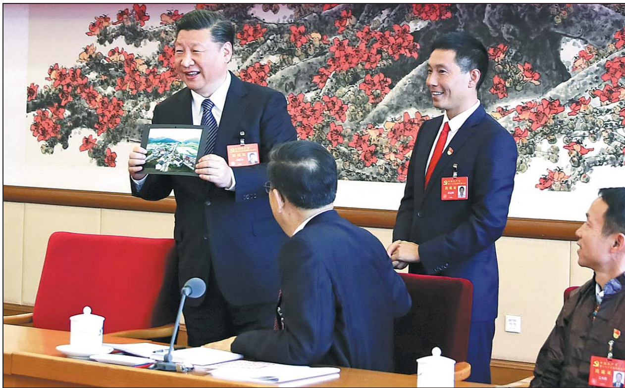
General Secretary Xi Jinping is given a panoramic photograph of the village of Huamao in Zunyi by the village's Party chief. Xi received it during a panel discussion with delegates from Guizhou province on Thursday at the ongoing 19th National Congress of the Communist Party of China in Beijing.

According to the report delivered by Xi at the opening session on Wednesday, socialism with Chinese characteristics has entered a new era. The report also said that the country's principal contradiction has evolved to be the one between unbalanced and inadequate development and the