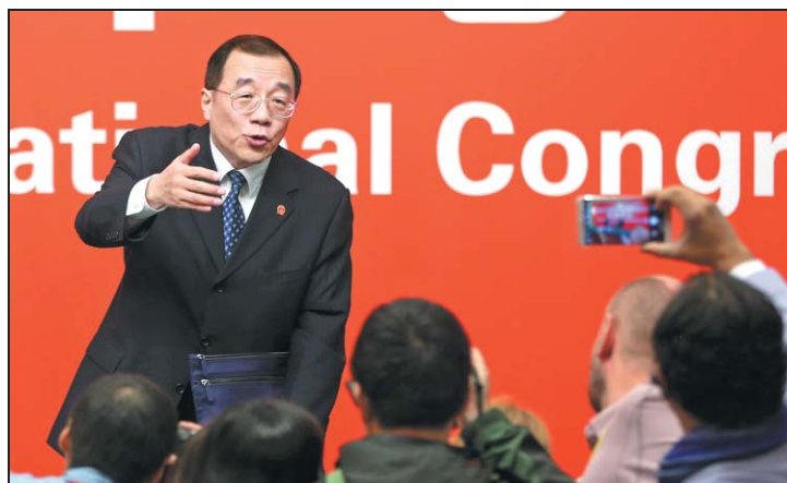
Yang Xiaodu, deputy secretary of the Communist Party of China Central Commission for Discipline Inspection, answers questions at a news conference on the sidelines of the 19th CPC National Congress on Thursday.