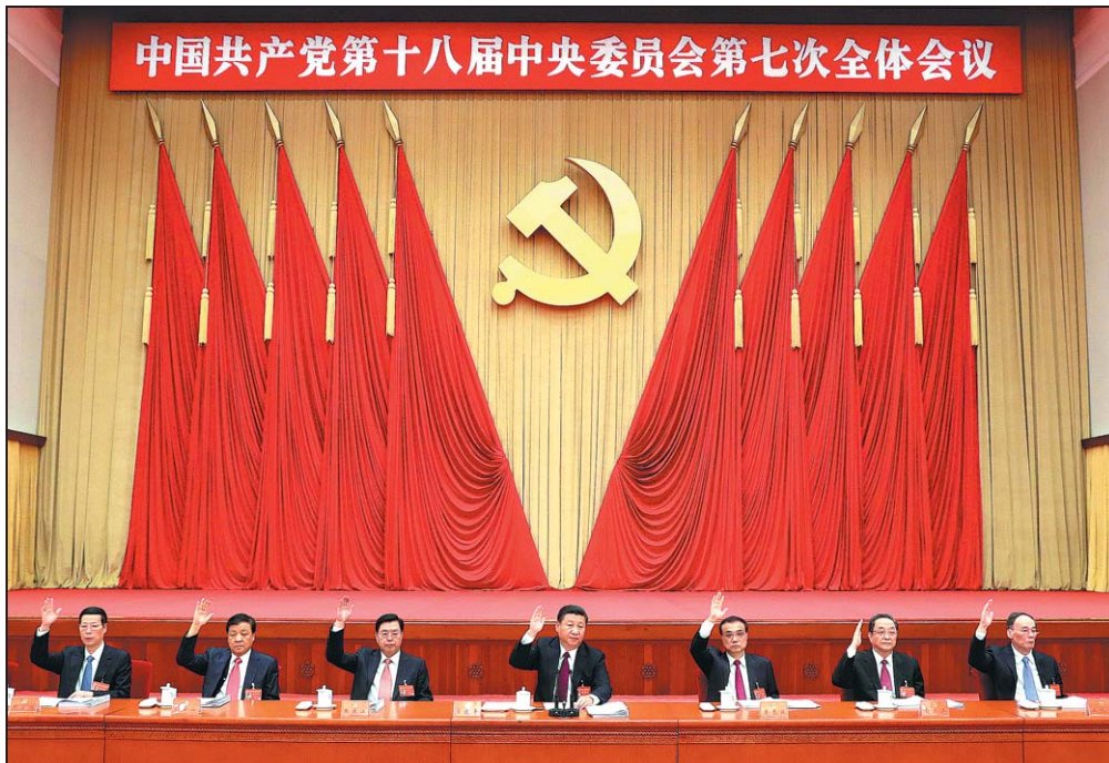
The Communist Party of China's top leadership, with General Secretary Xi Jinping at the center, takes part in the Seventh Plenary Session of the 18th Communist Party of China Central Committee in Beijing on Saturday.