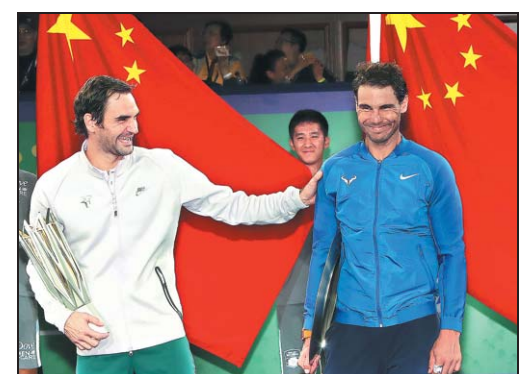
Roger Federer (left) was able to get one over on his longtime rival Rafael Nadal to win the Shanghai Masters tournament on Sunday in a showdown between the two best male tennis players on the planet.