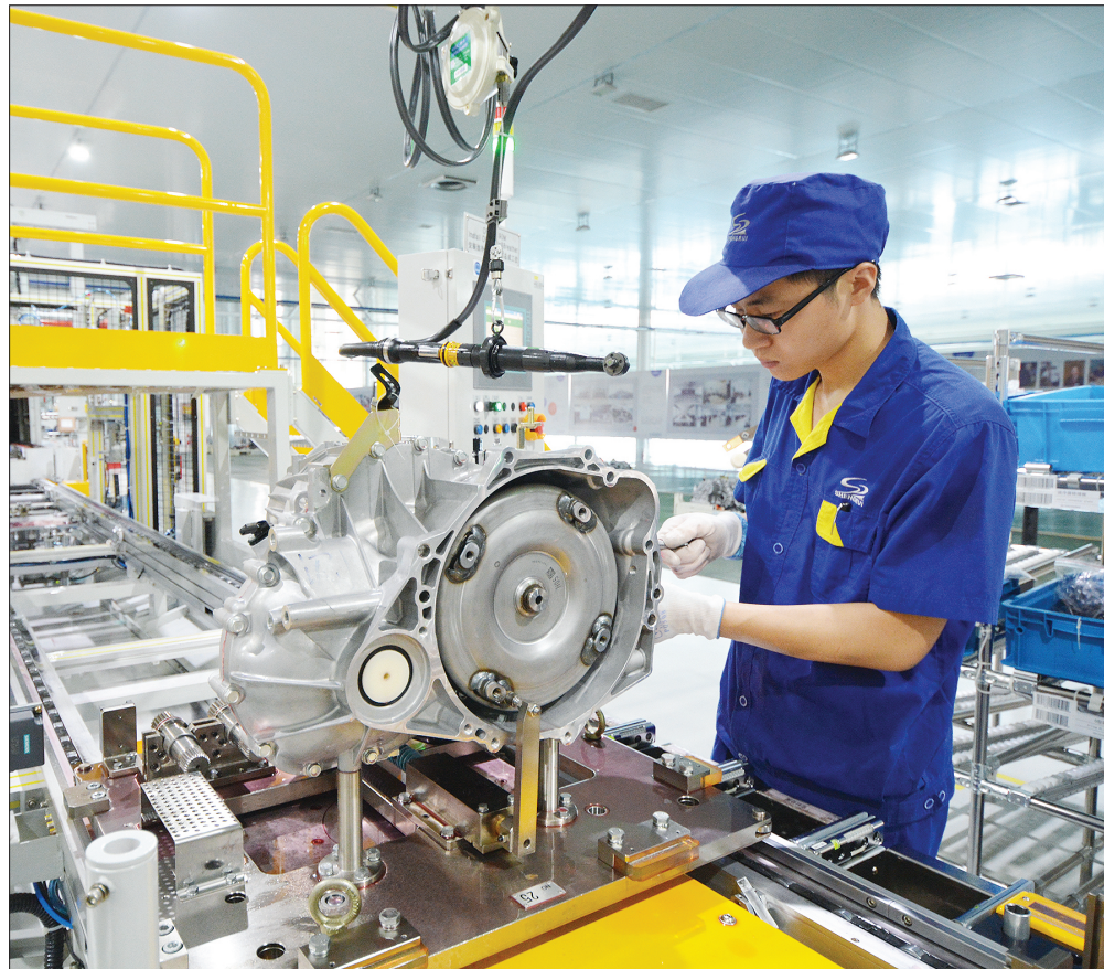
A technician assembles a product at Shengrui Transmission Co's 8AT production line. The company in the Weifang High-Tech Industrial Development Zone broke the monopoly in the Chinese market of foreign transmission manufacturers.

The company is strengthening its innovation capabili-