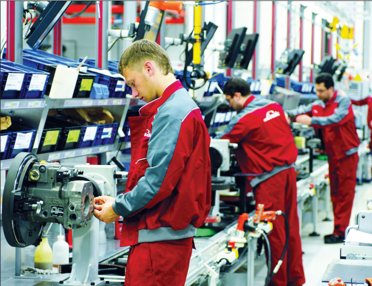
Workers operate a Kion hydraulics production line. Weichai Holdings Group purchased a 25 percent stake in the company in 2012.

The investment in Kion is proving to have been a good decision. According to Weichai, overseas income