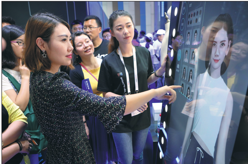
At the 2018 China International Big Data Industry Expo in Guiyang, Guizhou province, a visitor experiences a virtual fitting using equipment demonstrated by Alibaba on Saturday. The expo, which concludes on Tuesday, attracted over 40,000 participants from nearly 30 countries.