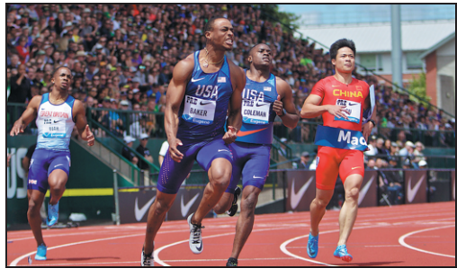
Su Bingtian competes in the men's 100-meter race during the 2018 Prefontaine Classic on Saturday in Eugene, Oregon. It was the third stop of the IAAF Diamond League.

After Su, 29, took the silver in 10.05 seconds at the Shanghai Diamond League, the second stop of the IAAF's prestigious global circuit, Su said that he was ready to regain his record.