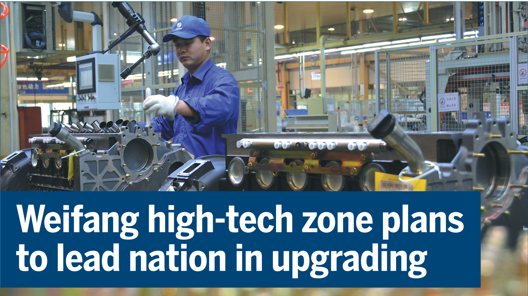
A worker checks equipment at Weichai Power in the Weifang High-Tech Industrial Development Zone. The company's transformation has made profits in the first quarter of 2016.

中国日报 CHINA DAILY A JOINT PUBLICATION OF CHINA DAILY AND STATE-LEVEL WEIFANG HIGH-TECH INDUSTRIAL DEVELOPMENT ZONE