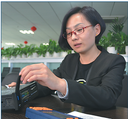
A Shandong Tianrun Logistics Co employee displays the Beidou Satellite Positioning System used to track truck drivers.