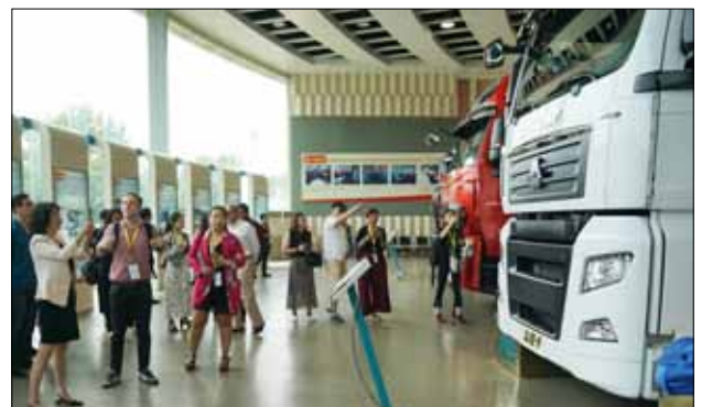
Sinotruk, a Jinan-based truck producer, has taken the lead in the Belt and Road Initiative, attracting Asian reporters.

To date, 279 trains transited between Europe and Asia and