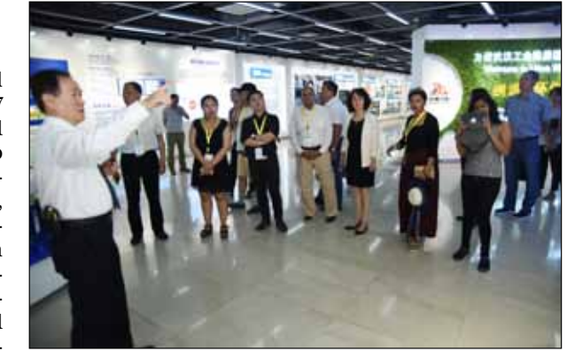
Asian reporters interview Linuo Group, a Jinan-headquartered solar energy company to take part in the Expo 2017 Astana.

Department, Shandong branch of China Council for the Promotion of International Trade.