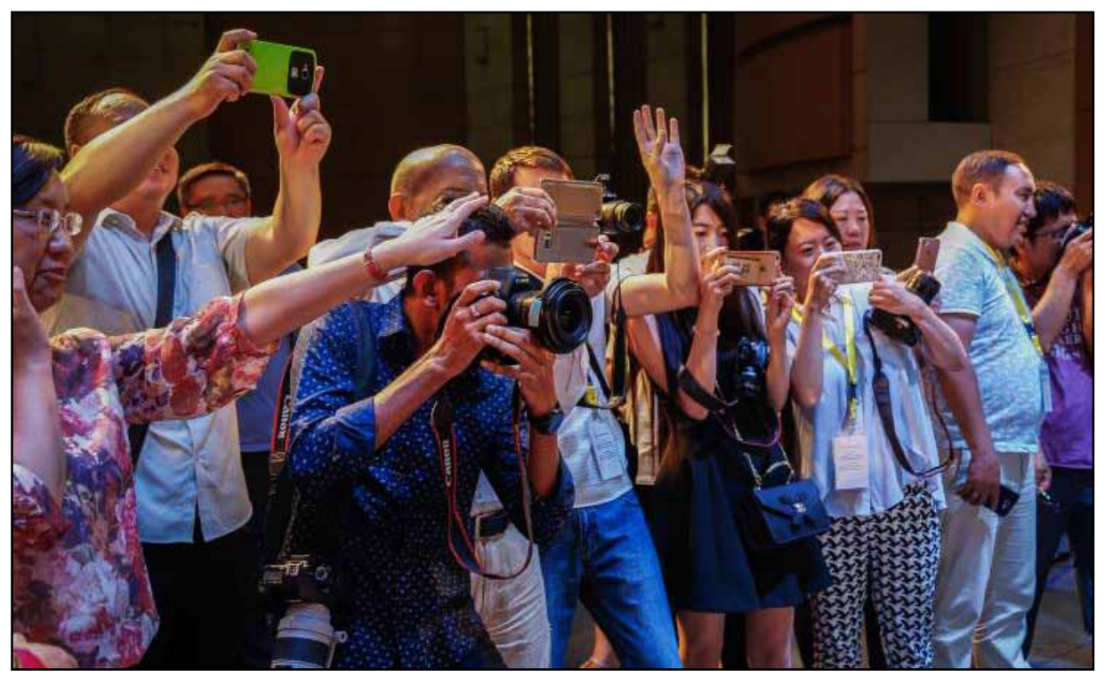
Reporters from Asian media outlets capture a fascinating moment of Lyuju Opera, a traditional opera style thriving in Dongying, Shandong province.

it empties into the ocean. Perhaps this see-saw act can best be embodied by Shandong's two most famous