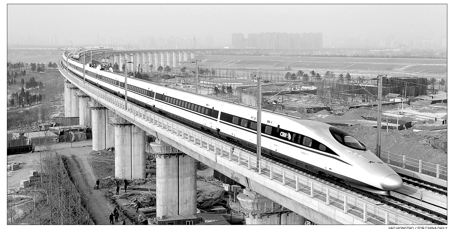
A bullet train passes on the Yongding River Railway Bridge, which goes across Beijing's Shijingshan, Fengtai and Fangshan districts and Zhuozhou in Hebei province.