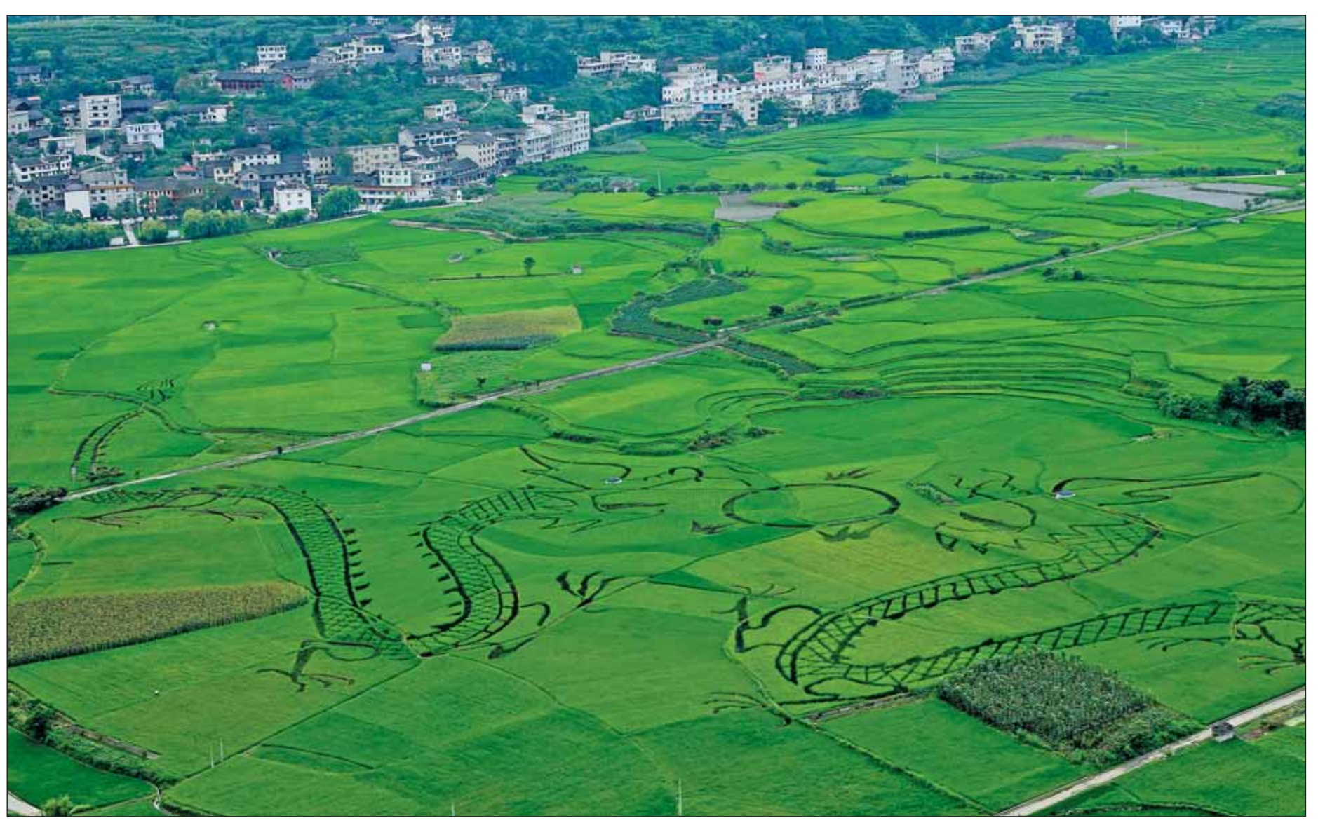
Two dragon patterns are created in the paddy rice fields around Shuitou village to celebrate the Year of the Dragon.