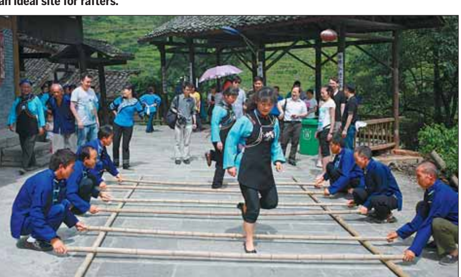
Local residents perform a bamboo dance to greet guests to Shuitou village.

Further upstream, there is an even quieter Bouyei community called Shuitou village. At the village gate, villagers in traditional costumes greet us with home-made wine and invite us to join their traditional bamboo dance.