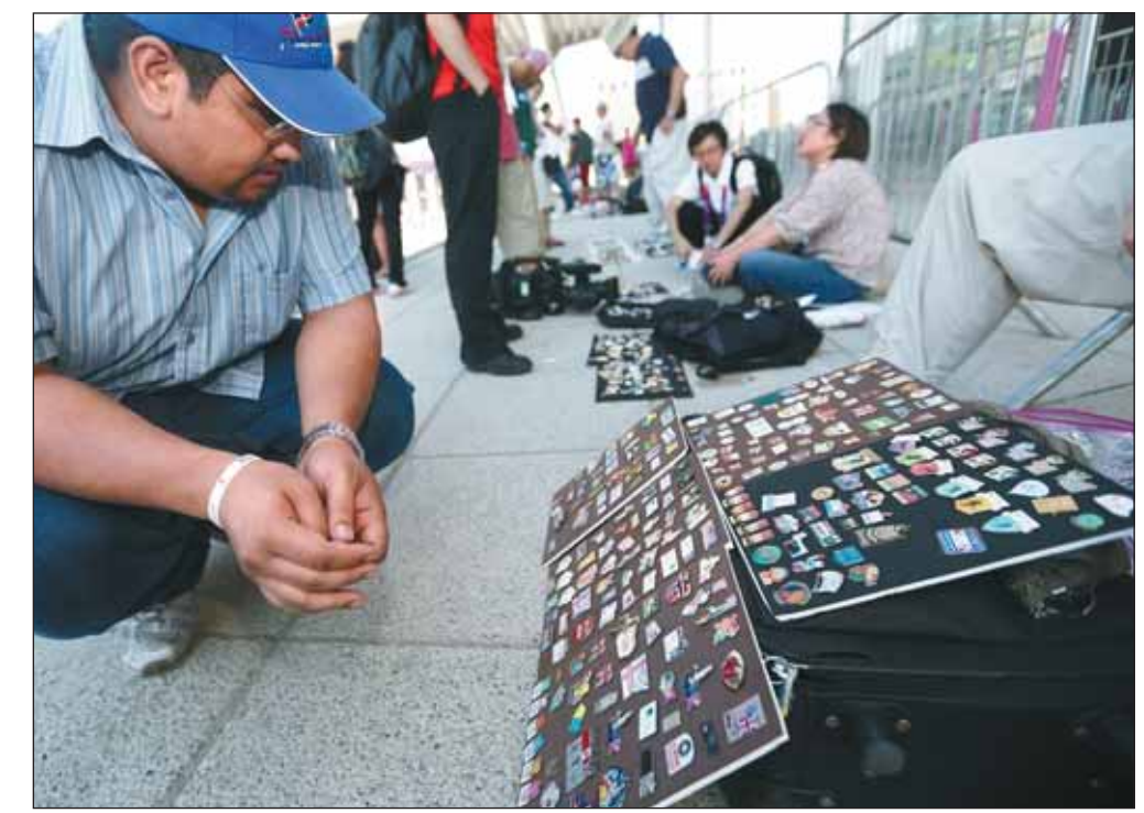
Pin collectors trade their favorites outside the Olympic Village in London, including the official 2012 mascots Wenlock and Mandeville, produced by Chinese manufacturers.

Before the Games, the leader of the US senate, Harry Reid, called for TeamUSA's uni-