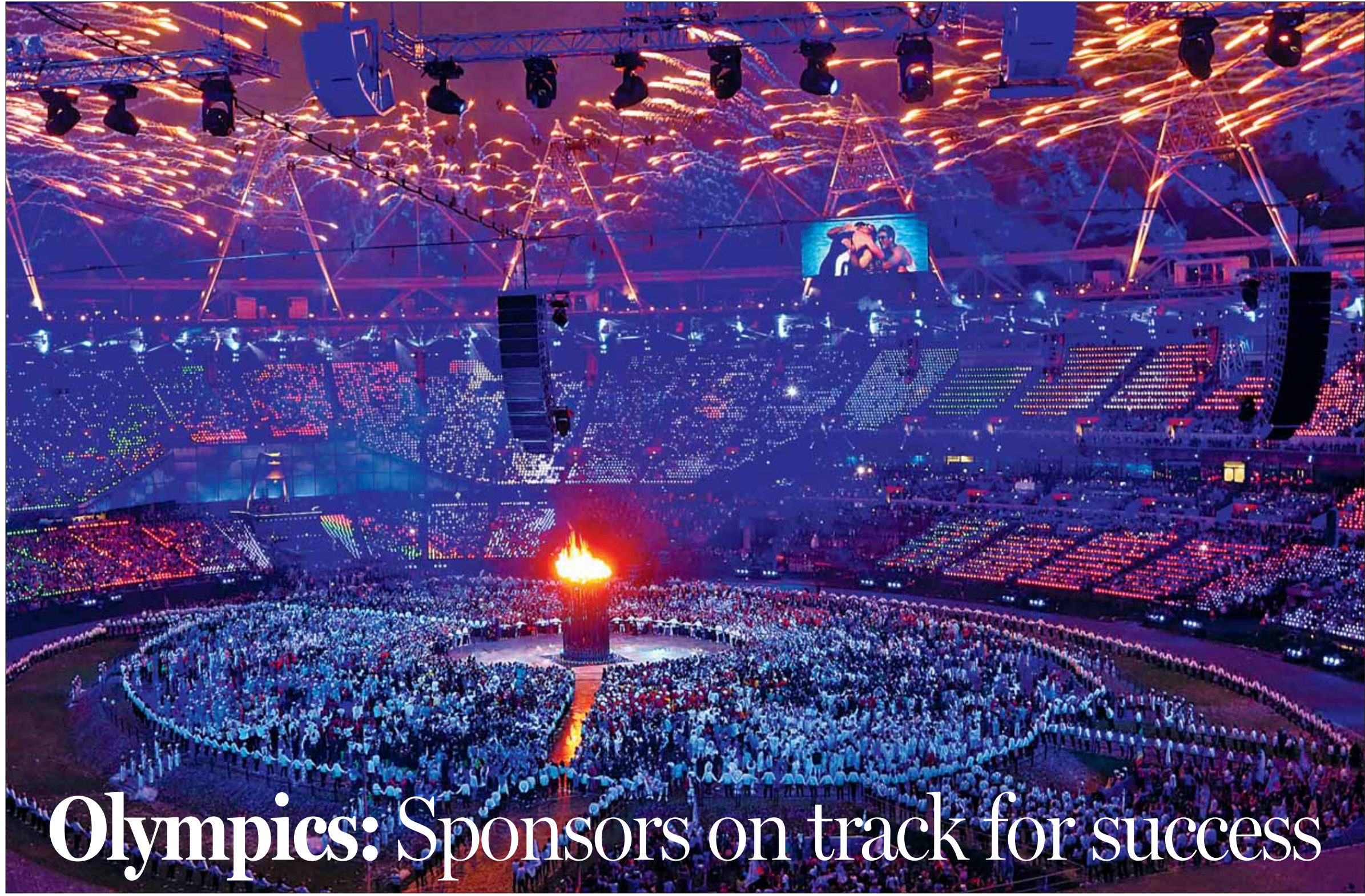
A scene from the opening ceremony of the 2012 Olympic Games. The lights on the seats were made by the Chinese company, Crystal CG International.