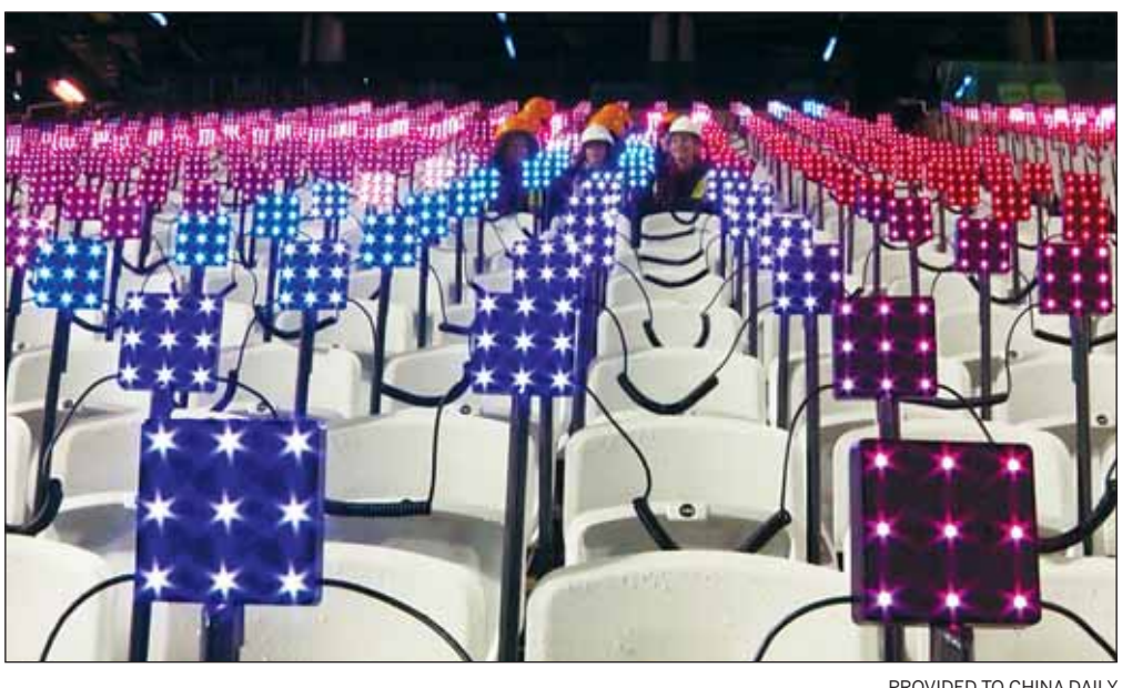
LEDs at London 2012 by Crystal CG International, which rose to fame during the 2008 Beijing Games. The company also provided animations for the opening ceremony in London.

forms to be piled in a heap and burned. Reid was outraged that the outfits were designed by the US couturier Ralph Lauren, but made in China.