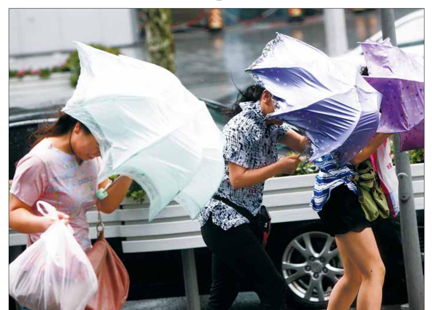
Women walk into the wind on Nanjing Road as Typhoon Haikui hits Shanghai on Wednesday.

In nearby Zhejiang, Haikui caused widespread flooding