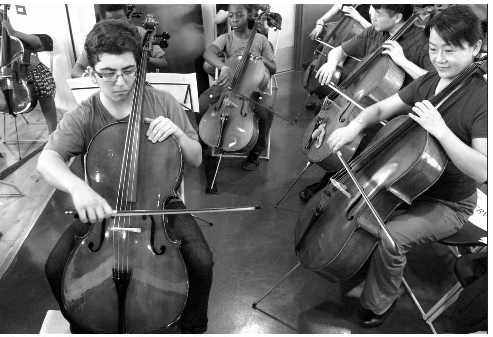
Musicians from Beijing Symphony Orchestra rehearse with primary school students of London.