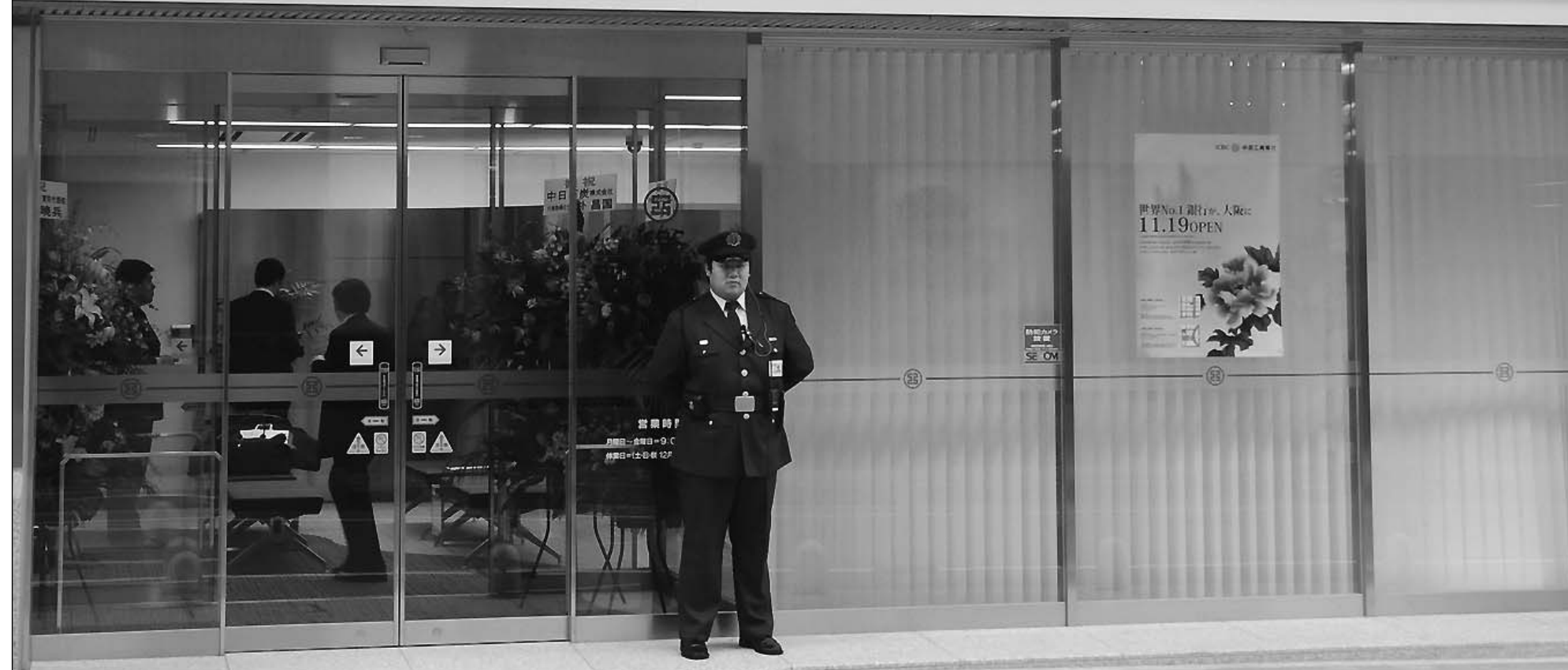
The Industrial and Commercial Bank of China's branch in Osaka, Japan, opened on Nov 19. The bank had 239 overseas outlets by the end of 2011.