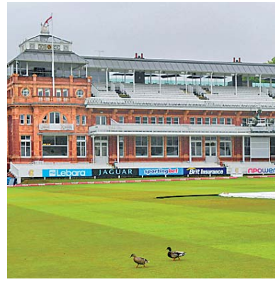
RCHERY - London's iconic cricket ground, Lord's, will host the archery, with the Democratic People's Republic of Korea and the Republic of Korea both aiming for gold. The ROK's double Olympic gold medal winner Im Dong-hyun is on target for a hat-trick – despite being legally blind.