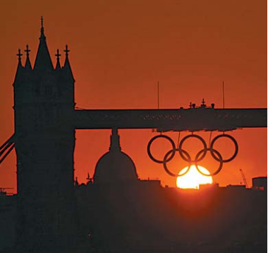
PENING - London's Olympic Stadium will be transformed into a rural British idyll for the opening ceremony on Friday. Danı Boyle — whose film Slumdog Millionaire won eight Oscars created the 27 million pound ($42 million) spectacle.