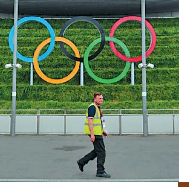
ONDON — The British capital is making Olympic history by being the first in modern times to host the Games