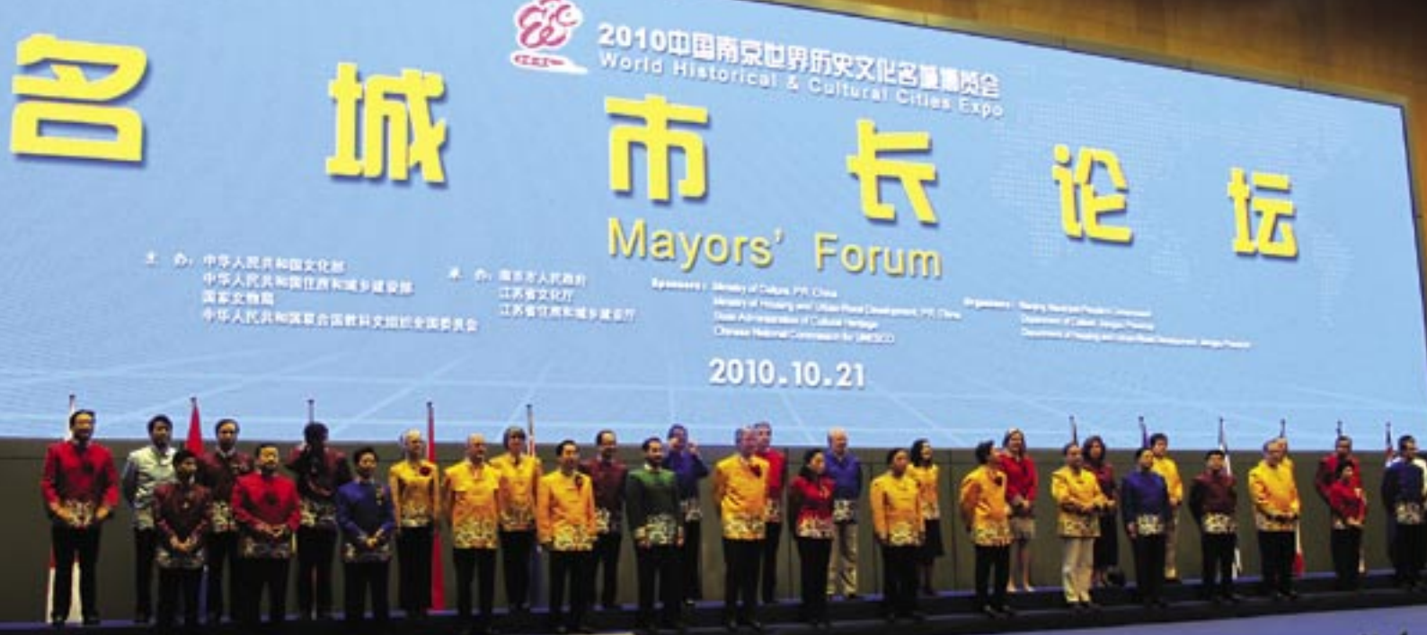
Mayors and representatives from 16 countries and regions pose for picture at the Mayor's Forum.