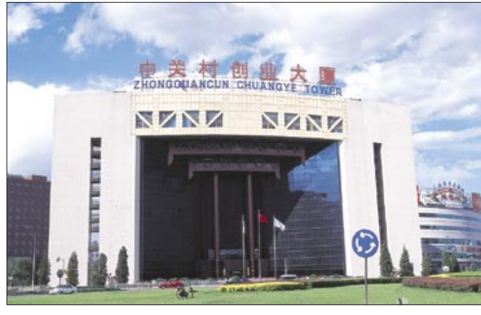
The Zhongguancun Business Initiation Center.

Some technology developed by enterprises in the park has already been applied to Shenzhou V, VI and VII Spacecraft and Chang'e 1 lunar probe. The Beijing Olympic Games and Shanghai Expo have also benefited from the park.