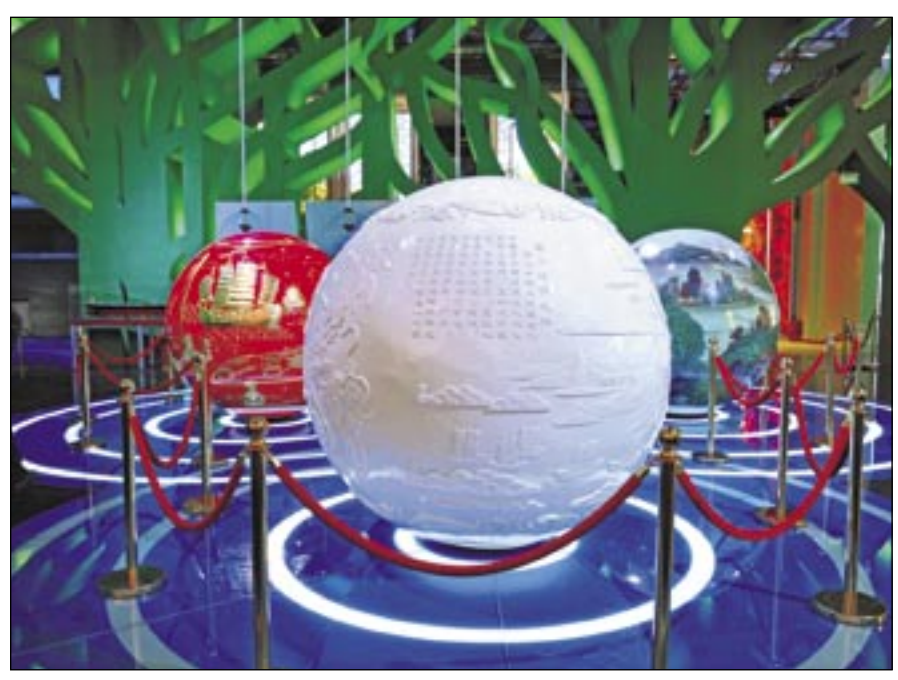
Inside of the interactive zone