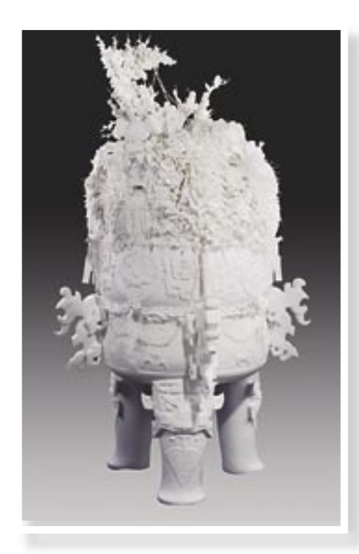
A 'ding' (a traditional Chinese carving) specially made for the World Expo