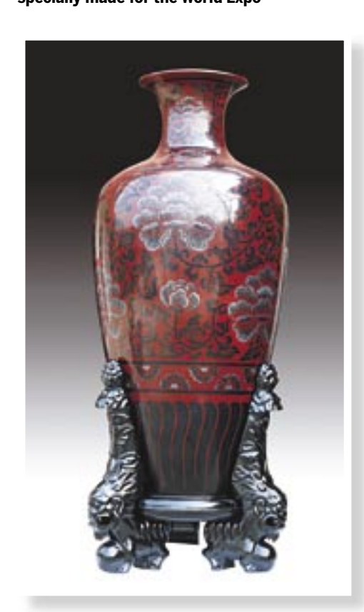
To make this bodiless lacquer vase requires skilled craftsmanship