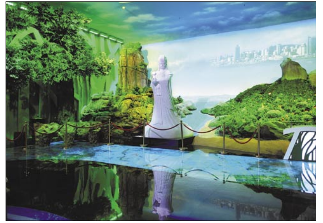
A marble sculpture of the sea goddess Mazu, standing at 3.23 m high

wide and 4 m tall, made by one of Fujian's enterprises, highlighting the province's electronics and machinery industries.