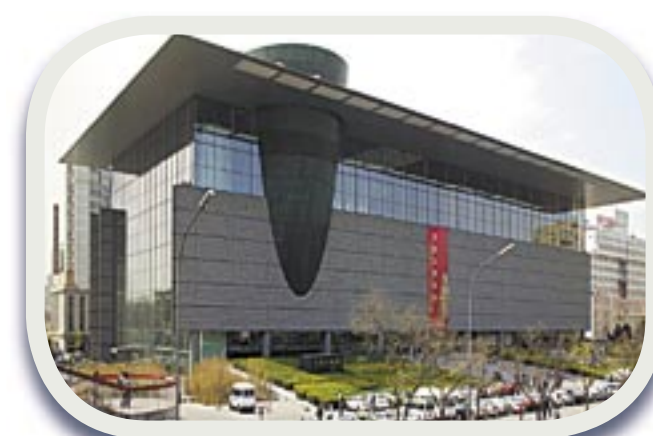
Capital Museum opened in June 2006 on Chang'an Avenue, which crosses Beijing from east to west. Its design is a blend of the past and present.

: You have been working at AREP for 10 years. I can see that you are very enthusiastic when we talk about