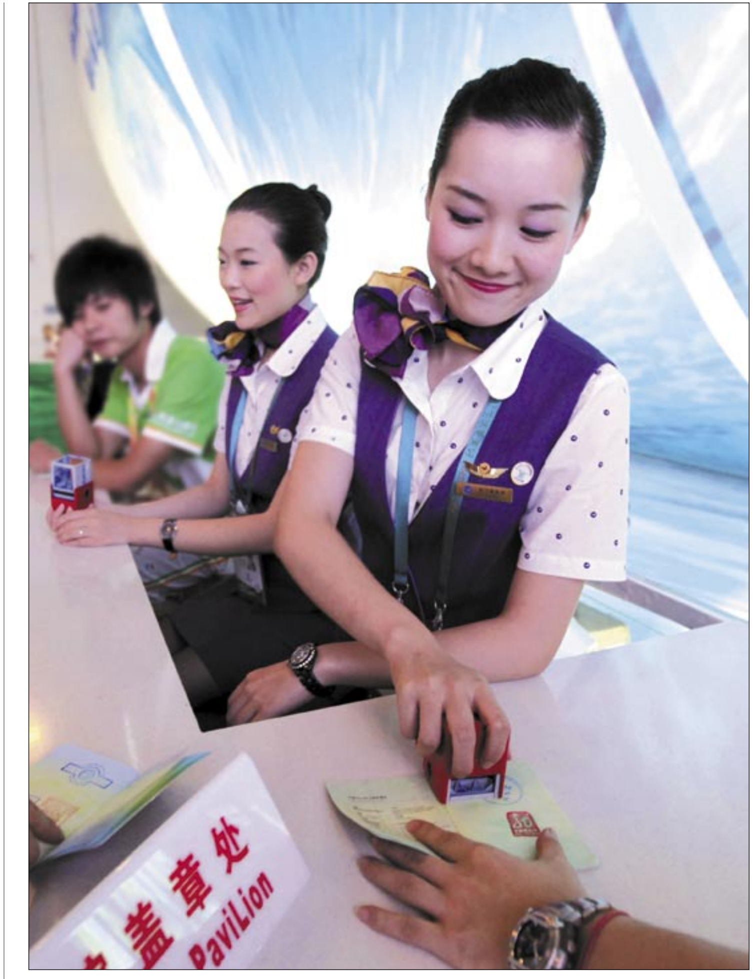
STAMP COLLECTING

tourism development projects, for which they would seek foreign investment of 12 billion yuan.